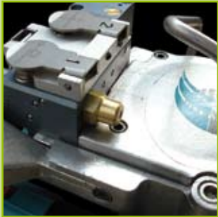
New cooling welding time indicator