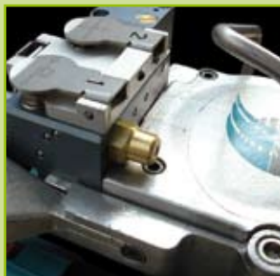
New cooling welding time indicator